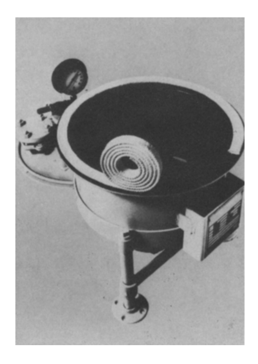
Chicago Tuflex Gasket Tape

• Chicago Gasket Company is marketing a new product call Chicago Tuflex Gasket Tape to allow fabrication of gaskets in the field or on the job. The tape is a tubular braid made of Teflon TFE fluorocarbon fiber Teflon impregnated. The tape will withstand chemical attack across the entire pH range, the firm says. Further information on the tape, available in five sizes, is available from Chicago Gasket Co., 4711 Golf Road, Suite 708, Skokie, IL 60076.